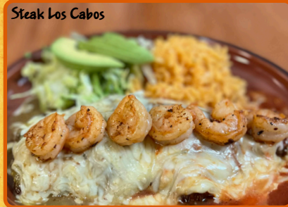
Steak Los Cabos

PATRONES PLATE* Chicken breast, steak arrachera, grilled shrimp and grilled vegetables. Served with rice, beans and guacamole salad. 23.95